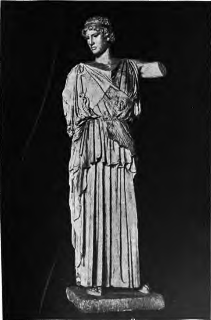
Fig. 10. Athena (known as "Lemnian Athena").